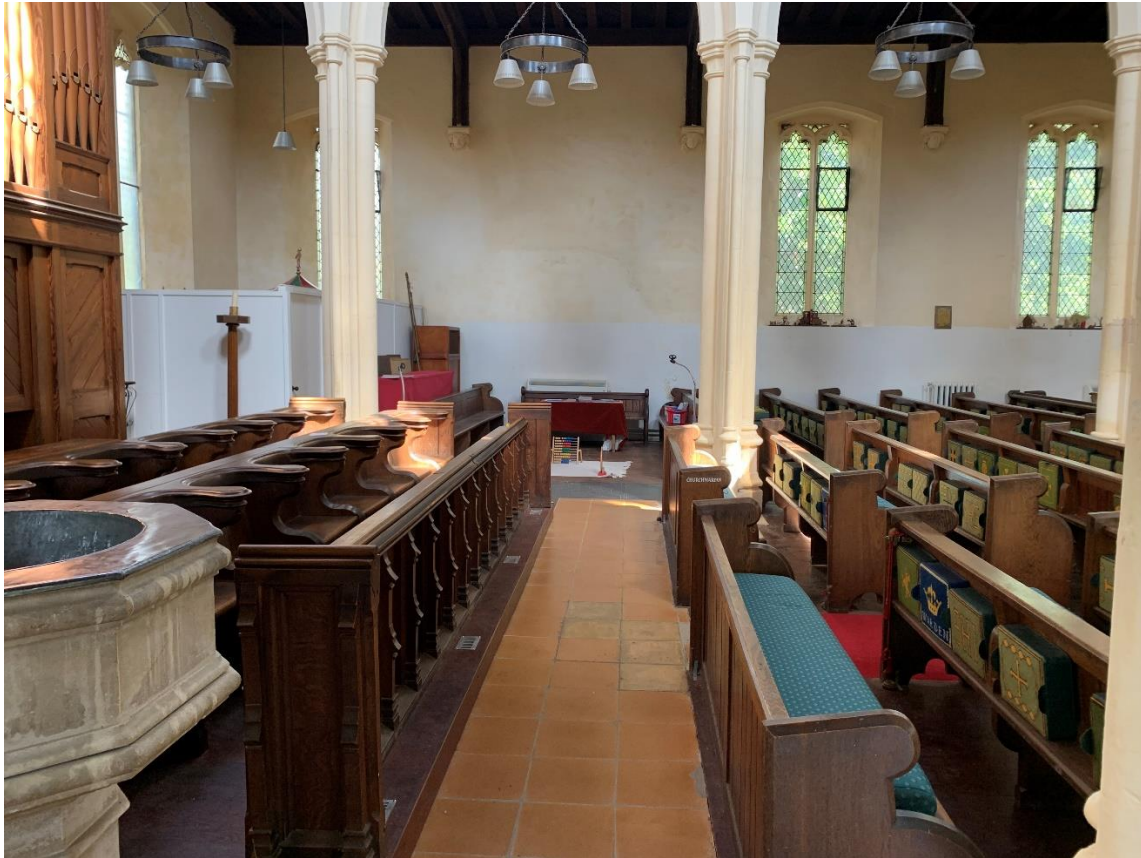
View of the Children's Corner from the entrance/Font

Proposal – Hospitality Space: The PCC would also like to apply for a faculty to remove five pews in the south-west corner of the church to create a flexible space which would greatly improve the welcome and hospitality we are able to offer as a church.