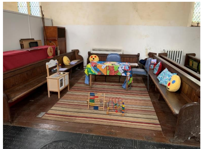
Ater TMRO (Now)

To further improve this space, we would like to remove the small pew that currently sits sideways-on, parallel to north wall.