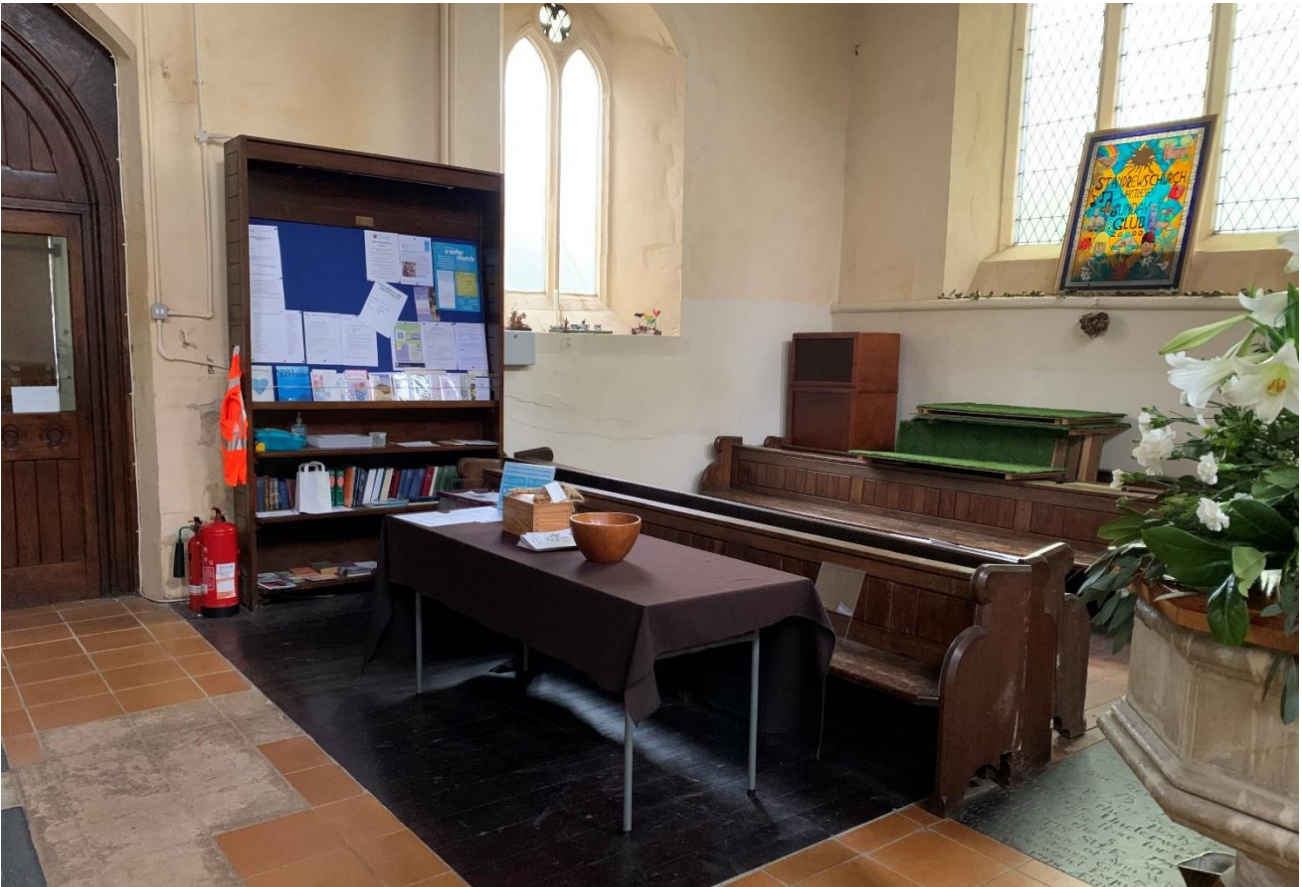
South-West Corner as it looks currently.

Tea/Coffee is served from this table after the Sunday service which also (for lack of room/options) doubles up as a Welcome Table and Donation Station.