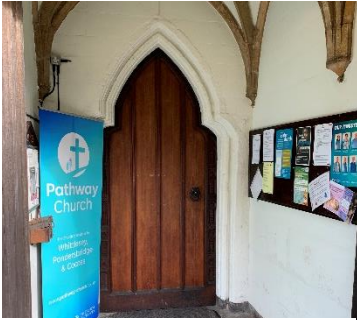
Current Entrance (South Door)

At the moment, the entrance to St Mary's is found 'round the back' and the way into church can be hard to find for visitors. When you reach the main entrance to St Mary's you are met by a large wooden door and whilst we generally leave this open during the warmer months - along with the North Door - in the winter we have to keep this closed to make efficient use of our heating.