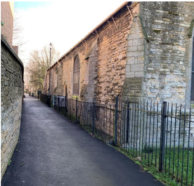
North Door - external view

Historically, the main entrance to St Mary's was through the North Door, which is situated on the main walkway which provides access to the churchyard. However this entrance - whilst easier to find and reach from the outside - has a number of steps which have worn uneven over time, making it an unsuitable access point for the less able and disabled.