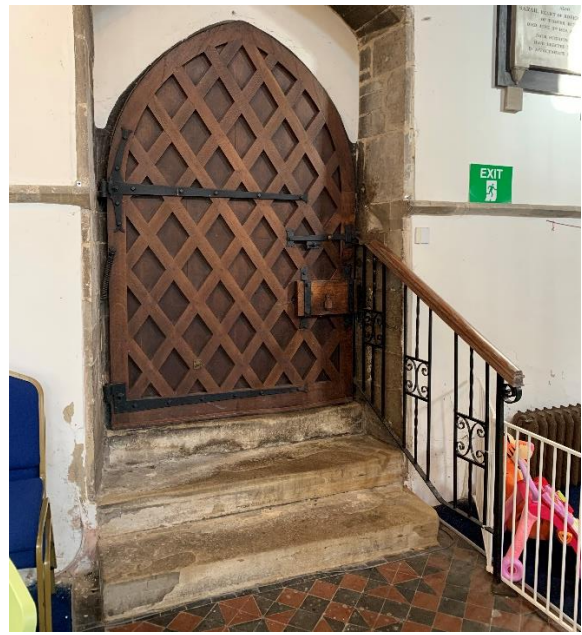
North Door - internal view

We know that the current main entrance to St Mary's is not the most obvious and how daunting it can be walking into a church building for the first time. We would seek advice from our architect on whether a more practical and accessible entrance to St Mary's could be found - either by adapting the entrance at the north door or the west door.