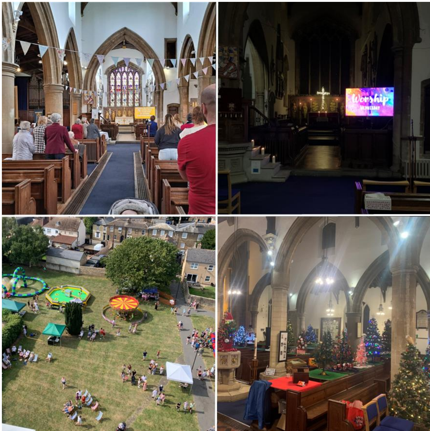
Top Left to Right: Sunday Worship; Worship Wednesday; The Whittlesey Festival in the Churchyard; The Christmas Tree Festival.