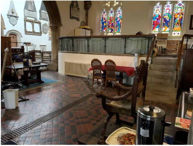
The South-East corner of the Church, showing the elevated platform on which the Sir Harry Smith Chapel sits.