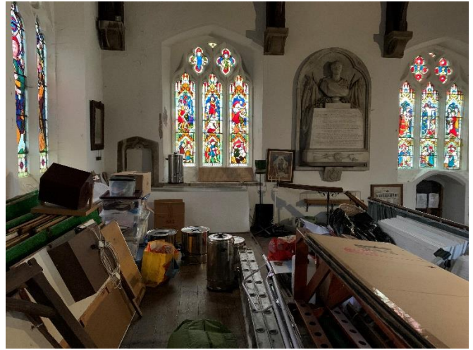
The Sir Harry Smith Chapel. A memorial to Sir Harry Smith can be seen in the top right corner - to the right of the stairway.